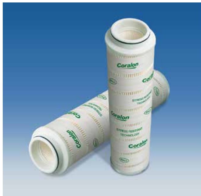
Coralon X321 Filter Elements