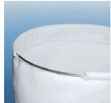
SNAP-RING seal ring